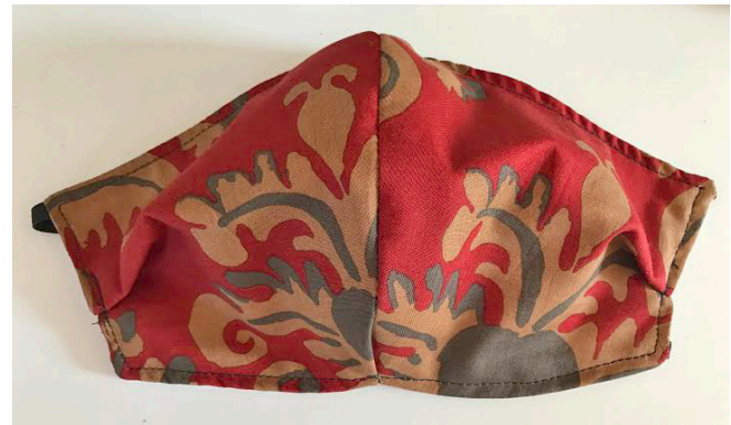
Note light color on inside vs. contrasting decorative fabric which indicates outside of mask.

Elastic – 1/4” or narrower, if you have it. Try searching “elastic” on eBay