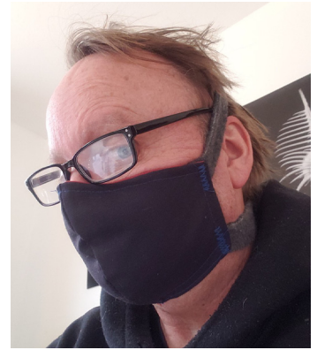
Note, photo on right: Elastic substitute, polar fleece

Inner layer should ideally be a lighter color than the outside. Outer layer can be decorative or of a darker color than the inside. It's important to be able to tell the inside from the outside of the mask easily. Bedsheets are a common fabric and suitable for the sewing this pattern.